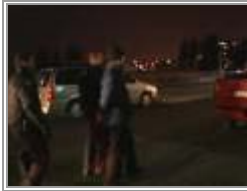
Pastor Arrested for Preaching the Gospel.

http://www.youtube.com/watch?v=doBKjgLBey8&feature=related