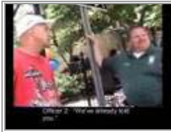
195 Seconds to Arrest-Peaceful Christian Pastor...

http://www.youtube.com/watch?v=a3MA3ue7ocE&feature=related