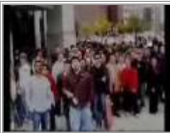
The Arrest, Trial and Acquittal of Street Preacher.

http://www.youtube.com/watch?v=l4ZubiSXTfY