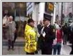
STREET PREACHERS ARRESTED IN NORWAY PART TWO

http://www.youtube.com/watch?v=bKl6xxjzXyI&feature=related