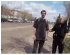
Arrest for Street Preaching

http://www.youtube.com/watch?v=u-I_D-gJHgU&feature=related