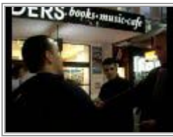
Street Preachers Arrested, Australia

http://www.youtube.com/watch?v=-6oHoCl0BZc&feature=related