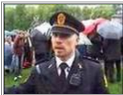
STREET PREACHERS ARRESTED IN NORWAY PART ONE

http://www.youtube.com/watch?v=PHJ8NF3_UOo&feature=related