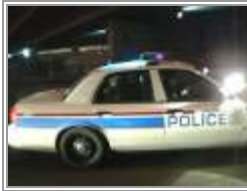
Pastor Arrested for Preaching the Gospel part 2.

http://www.youtube.com/watch?v=q8Vddo6VlsY&feature=related