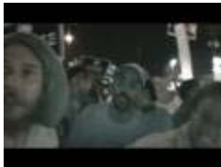
Arrested for preaching against Obama (part2)

http://www.youtube.com/watch?v=TVUq-OcbTsM