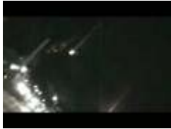
Arrested for preaching against Obama (part1)

http://www.youtube.com/watch?v=iSJF0WPTU2k&feature=related