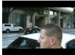
Larry cited for preaching

http://www.youtube.com/watch?v=6K3kdgGG9co&feature=related