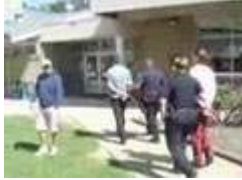
Arrests at A-B Tech (Free Speech)

http://www.youtube.com/watch?v=u-I_D-gJHgU&feature=related